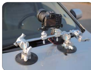
With Camare Bracket