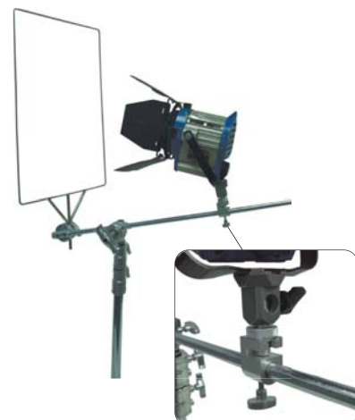
With Lighting Fixture