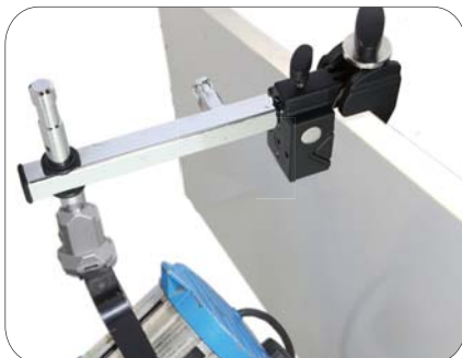
KS-010 with Convi Clamp