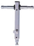
KS-010 Offset Arm 215mm (8.4")