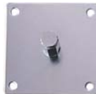
KS-011 100mm Square Mounting Plate