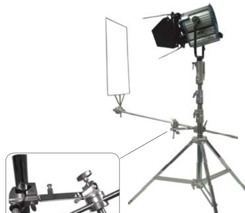
KS-010 with Convi Clamp