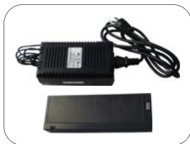
DCP-12 120V - 230V AC to 12V DC transformer with dummy battery