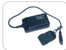
MCR-1 Remote Controller