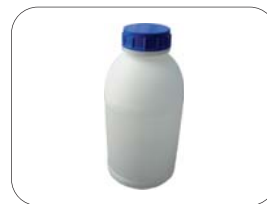
FLQ-500 500ml Liquid