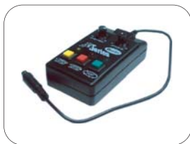
MCT-1 Timer Controller